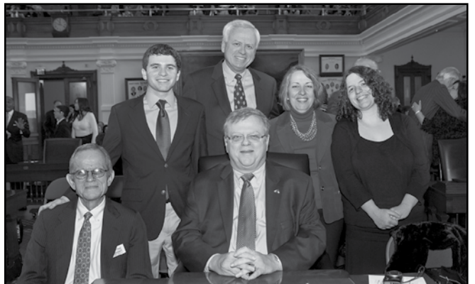
Senator Bettencourt poses with his family at his desk on the Senate floor.

Highlights of the 84 th Legislative Session