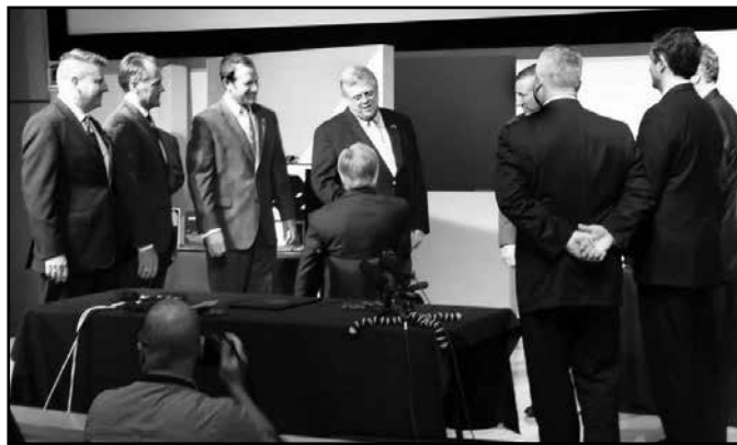
Senator Bettencourt with Governor Abbott at the HB 1 bill signing ceremony, where the Governor referred to Senator Bettencourt as the "Architect of Tax Relief."