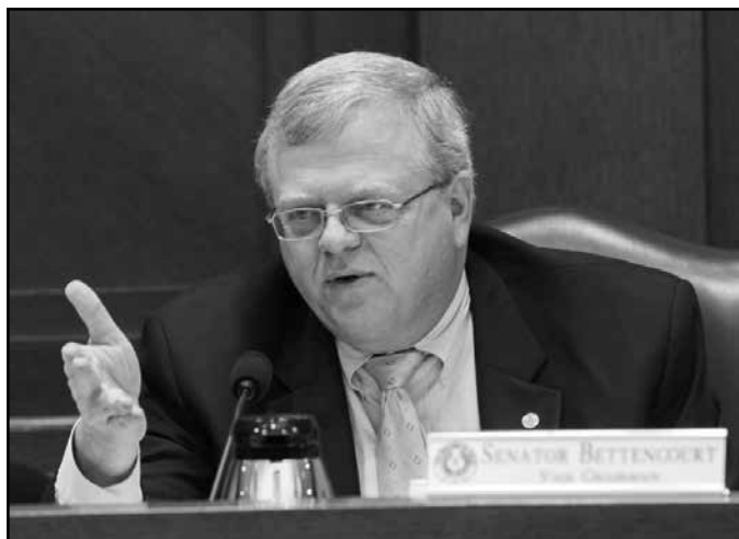
Vice Chairman Bettencourt discusses important issues before the Senate Committee on Intergovernmental Relations.

SB 1760 also requires the Comptroller of Public Accounts to provide a list of statewide property tax rates (for taxing units other than schools) each year, with the rates listed from highest to lowest. This will make it much easier for taxpayers to compare tax rates between neighboring taxing units. SB 1760 is a good first step in increasing the transparency and accountability of the property tax rate setting process.